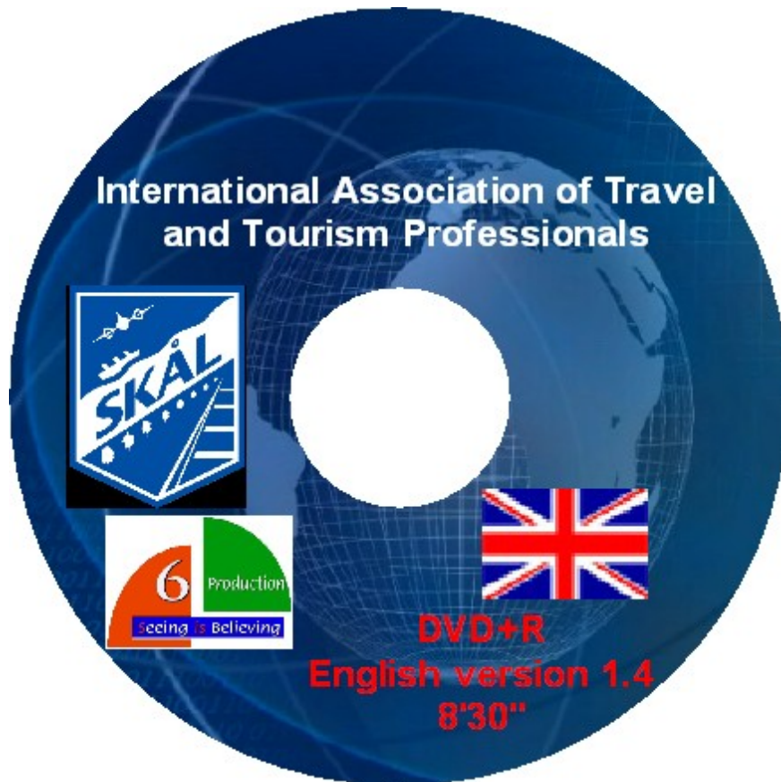
FIGURE 21.1 Contact your Club President or Membership Development Office to obtain a copy of the DVD.

A copy of this DVD has been sent to all clubs in Canada.